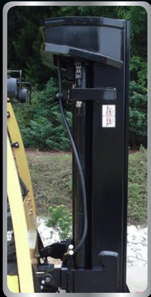
COMPACT RAIL STACK REDUCES LOST LOAD CENTER AND MAXIMIZES CAPACITY